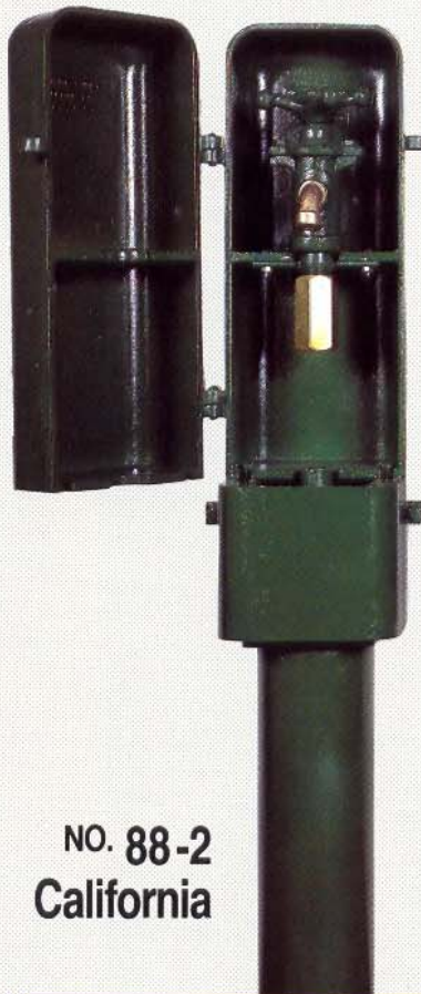
NO. 88-2 California