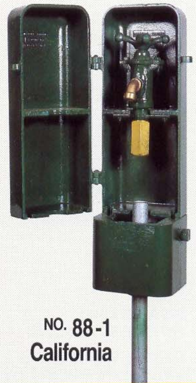
NO. 88-1 California