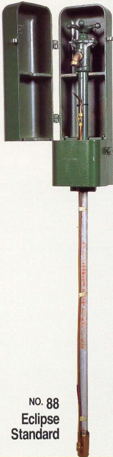
NO. 88 Eclipse Standard